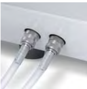
quick release connector

The large integrated funnel-shaped opening of the water storage tank makes it easy to fill the tank with demineralized or distilled water in the Euroklav® 23 S+, 23 VS+ and 29 VS+. Alternatively, both autoclaves could be fed the required water supply from any external reserve vessel or even be connected to a water-treatment unit.