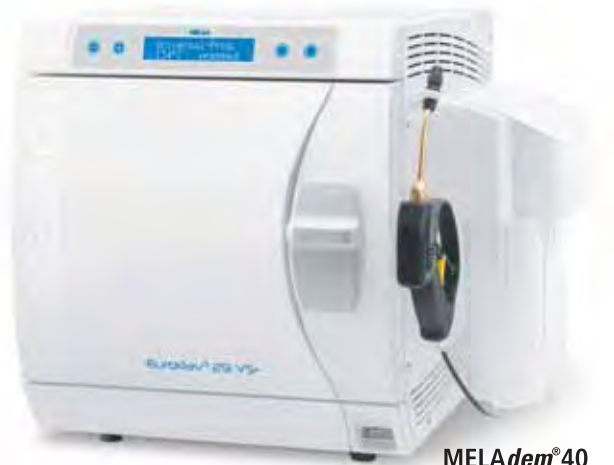
MELAdem® 40 mounted on the Euroklav® 29 VS+

Operating the autoclaves should be both pleasurable and safe. The design fully supports this demand. It shows what's essential, and does its work efficiently. The large door lock is not only a design feature, but also ensures a safe and easy opening and closing of the door.